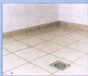
Internal Floor Drainage