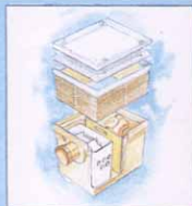
Grease Traps and Petrol/Oil Interceptors