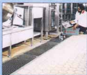
Stainless Steel Channel Drainage